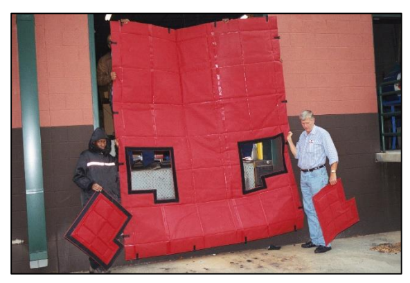
Custom Truck Cover

Tel +1 973-928-8300 www.mwtmaterials.com