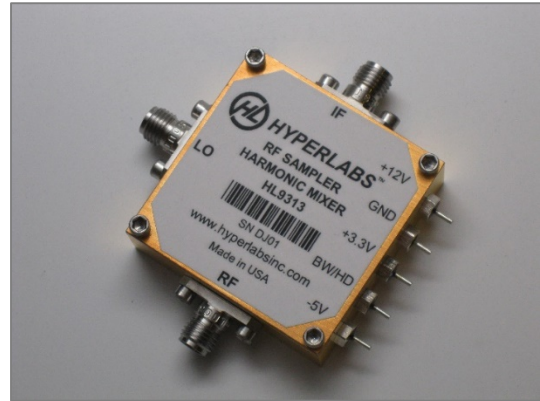
Figure 1: HL9313 Sampler / Harmonic Mixer

* NOTE: Harmonic distortion measurements taken under test conditions: LO = 1 GHz + 5 dBm, Pin = 100 MHz 0 dBm.