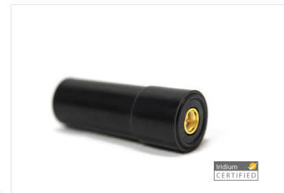
Image does not reflect the actual size of the antenna

M1621HCT-SMA is a high performance antenna designed for the Iridium band, built on proprietary Maxtena HeliCore® technology. This technology provides exceptional pattern control, polarization purity and high efficiency in a very compact form factor. The M1621HCT-SMA is a screw-on design, featuring an integrated SMA connector. This product is ideal for applications requiring minimal integration effort or for retrofitting existing products. The design is equipped with an O-ring that makes the antenna waterproof once installed on a mating surface.