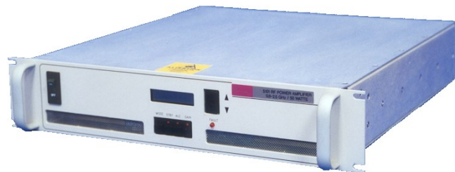
RE Model Shown