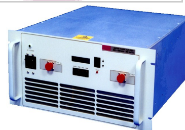
FE Model Shown