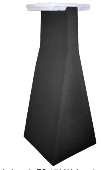
ETS-Lindgren's FS-1500H Anechoic Absorber