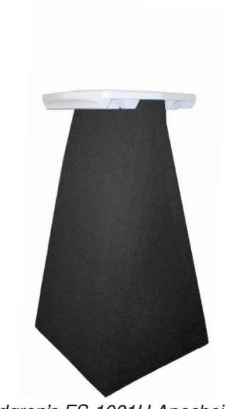
ETS-Lindgren's FS-1001H Anechoic Absorber