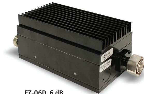
FZ-06D, 6 dB Low PIM Attenuator