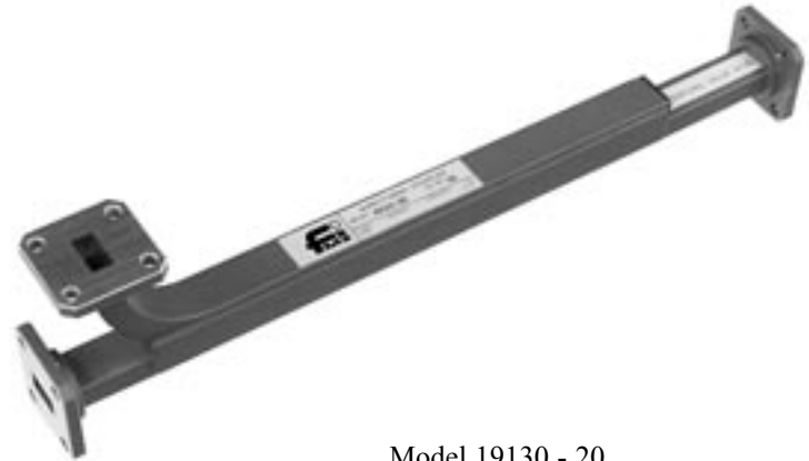
Model 19130 - 20

These couplers have a good directivity performance whilst retaining the minimal frequency sensitivity associated with higher quality units. The standard coupling values are 10 and 20 dB.