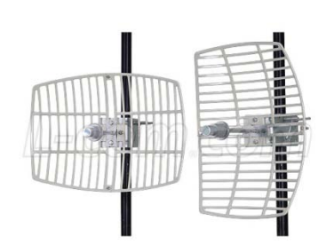
Vertical or Horizontal Polarization

This antenna is supplied with a 60 degree tilt and swivel mast mount kit. This allows installation at various degrees of incline for easy alignment. They can be adjusted up or down from 0° to 60°.