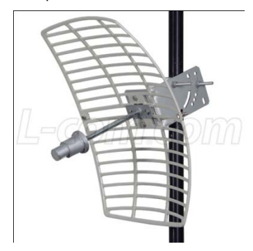
Tilt & Swivel Mast Mount